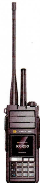
P.o.C Two Way Radio