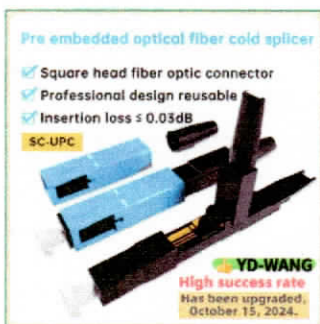
Fiber Optics Fast Connector, Single Mode SC UPC Quick Connector Adapter for 9/125um SM FTTH Optical Fiber Cable