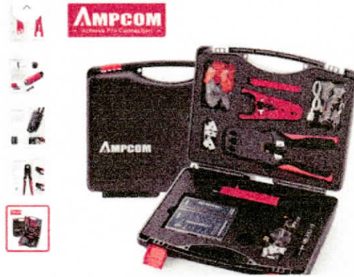
AMPCOM Network Tool Kit, 12 in 1 Professional Portable Ethernet Computer Maintenance LAN Cable Tester Repair Set