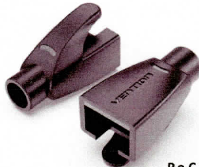
RJ45 CAT5E CAT6 Ethernet Network Connector Plug Cable Strain Relief Boots