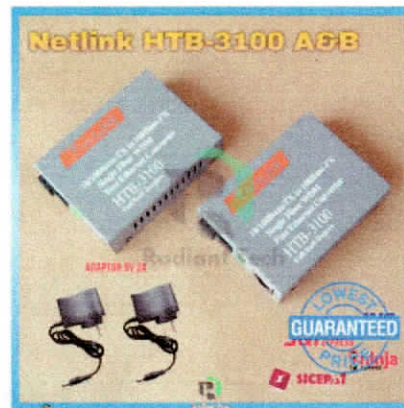
Fiber Optic Cable Single Core Fiber Cable