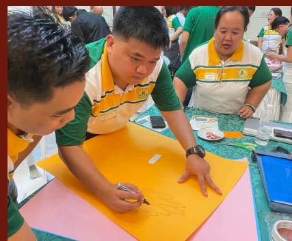
Participants draw parts of the body as part of the workshop activities

toward becoming the Region's University of Choice. The blueprint developed during this workshop will serve as a roadmap for the university's future growth and development.