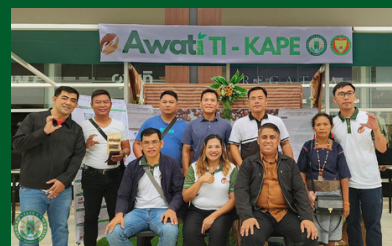
Awati TI-KAPE Team at their coffee booth

Additionally, MinSU, CavSU, and the LGU-Mansalay formalized their collaboration through a Memorandum of Agreement (MOA). Under this agreement, MinSU will provide research, training, and project supervision, while assisting in establishing a coffee farmers association. NCRDEC will offer technical expertise, resources, and training for coffee-related activities, while the LGU-Mansalay will promote coffee initiatives and support the partnership through resources and training.